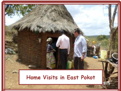
Home Visits in East Pokot