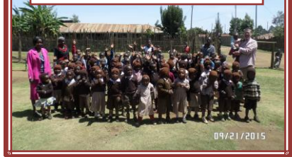
Merry Christmas from Glory Shiners Junior Academy