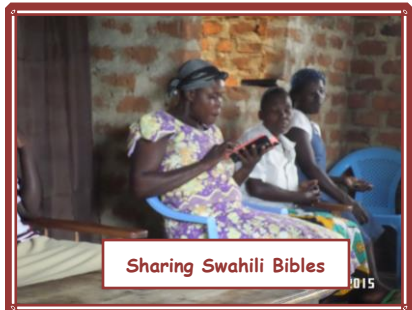
Sharing Swahili Bibles